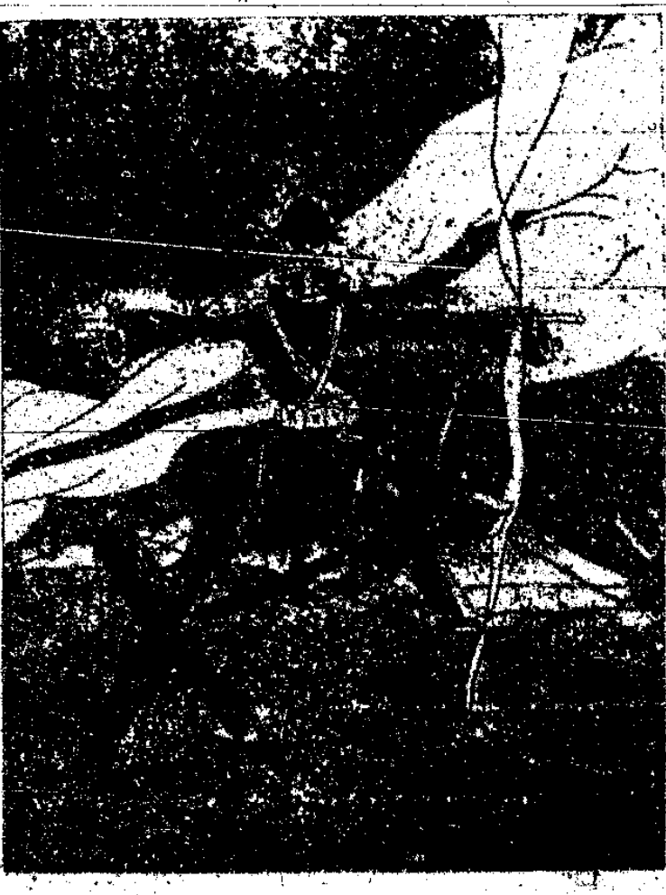
1917—War for Democracy Collection Security—193-2