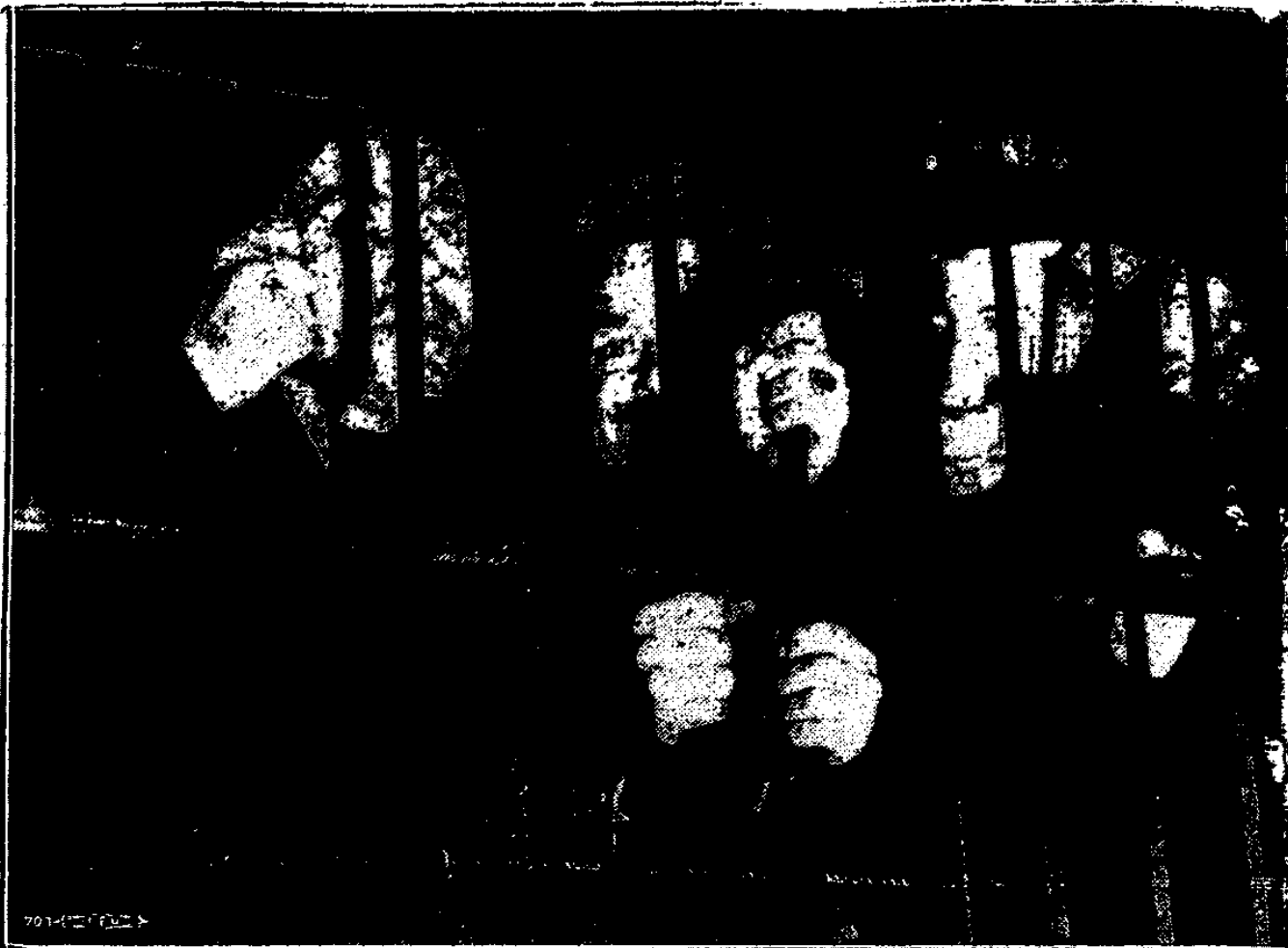
Striking auto workers are shown in jail at Kansas City. They continue the fight against Ford.